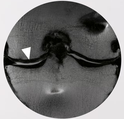
Cartilage implant, 6 months post-operative