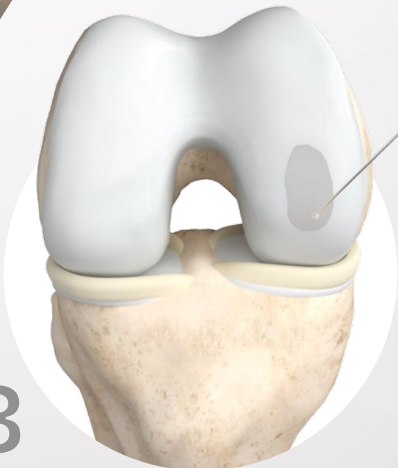
Defect filling with 3D matrix