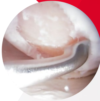
Debridement of the defect