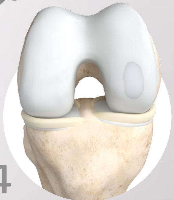
Dimensionally stable regeneration