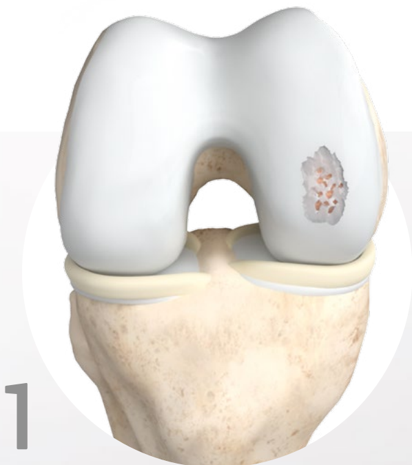
1 Cartilage damage grade III-IV