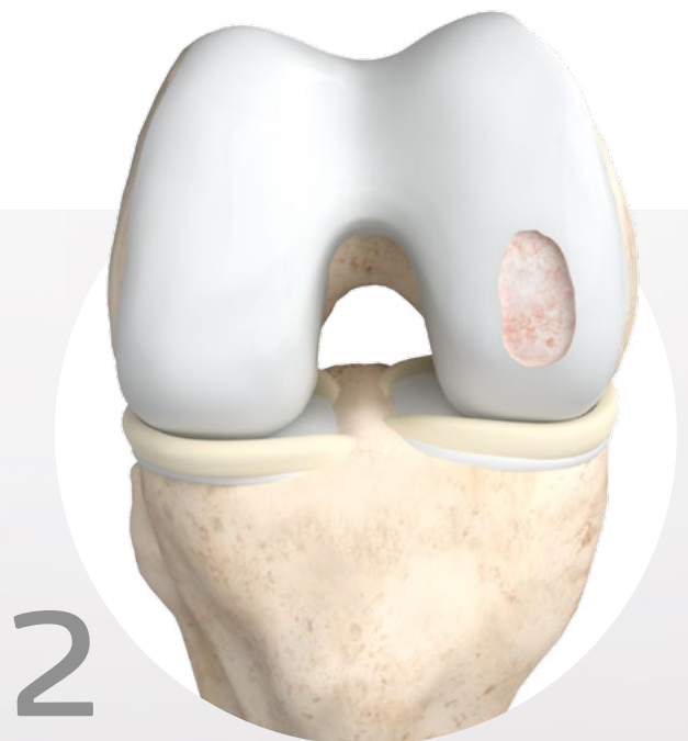
2 Debridement of the defect