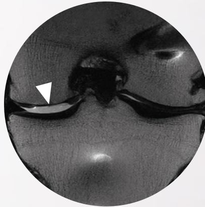
Cartilage implant, 6 weeks post-operative